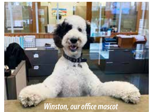
Winston, our office mascot

This program is administered by the Multi-Service Center on behalf of the U.S. Department of Health and Human Services. Learn more here: https://msc.itfrontdesk.com