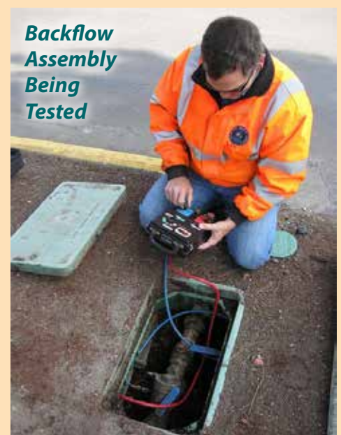
Backflow Assembly Being Tested