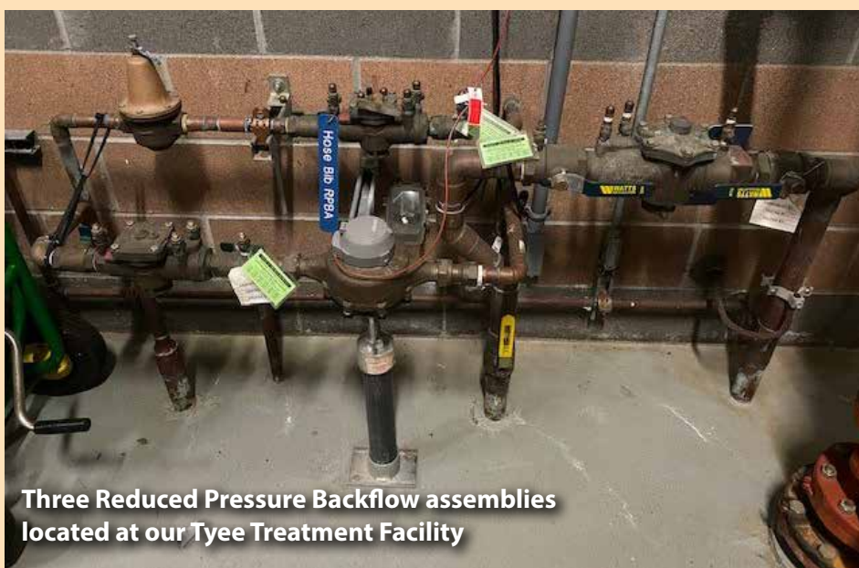
Three Reduced Pressure Backflow assemblies located at our Tye Treatment Facility

If you have any questions about backflow or any other water quality issue, contact our Water Quality Supervisor at (206) 592-8946.