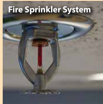
Fire Sprinkler System