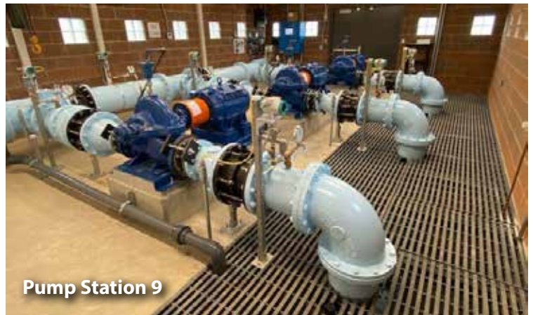
Pump Station 9

Information on lead in drinking water, testing methods, and steps you can take to minimize exposure is available from the Safe Drinking Water Hotline at 1-(800) 426-4791 or at www.epa.gov/safewater/lead . You can also find information on lead on our website at www.highlinewater.org .