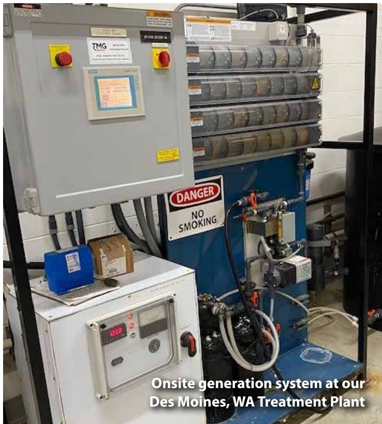
Onsite generation system at our Des Moines, WA Treatment Plant

Water from Highline's wells is treated at three facilities by: