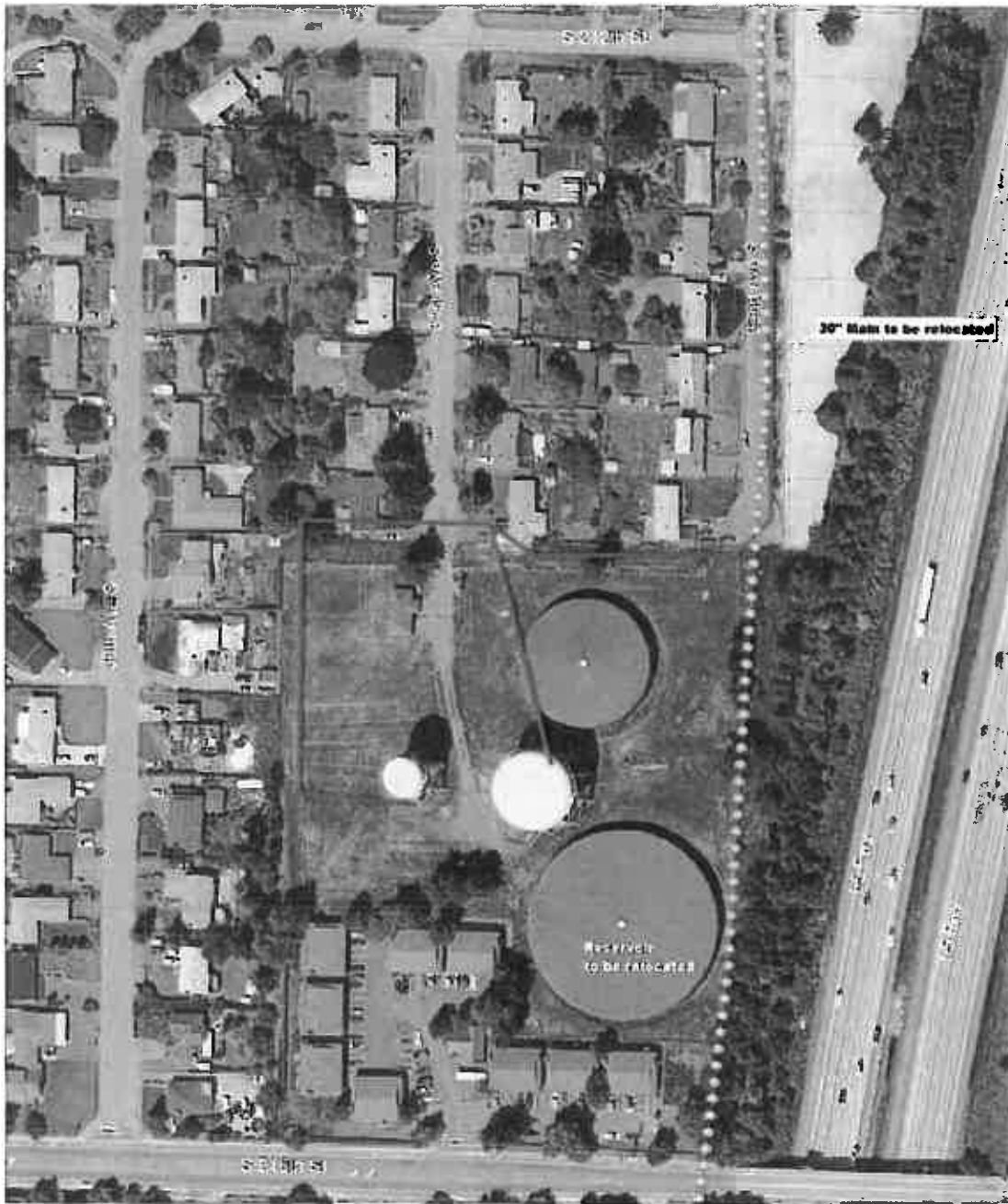
EXHIBIT A General Description of Highline Water District facilities